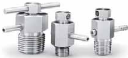
BV Series Bleed Valves